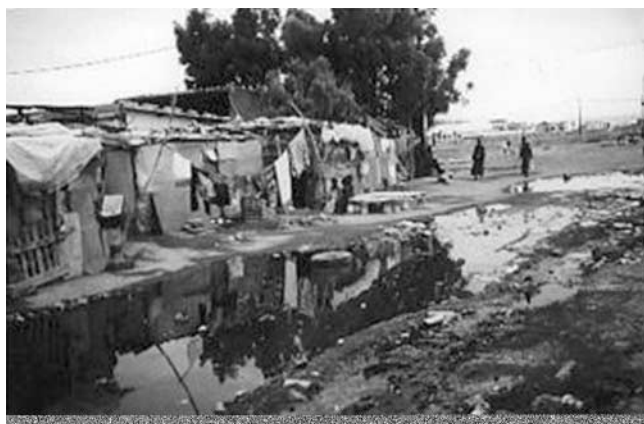
Figure 4 A refugee camp in Africa. Open sewage runs between the houses. When it rains this floods into the houses. Cholera is endemic in this camp.

Armed conflict is associated with poor child health; of the 20 countries with the worse under 5 mortality rates, only three of them were not involved in conflict between 1990 and 2000. 23 Two million children were killed in armed conflict between 1986 and 1996, 24 and