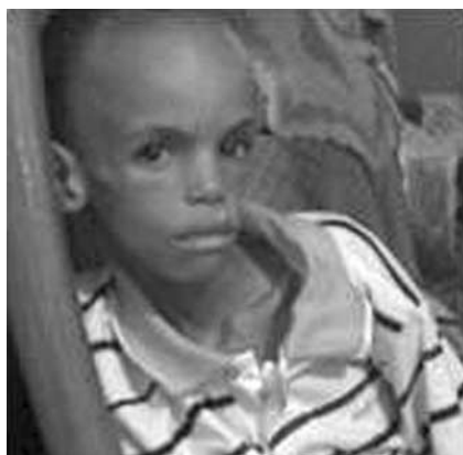
Figure 2 Child terminally ill with HIV/AIDS and severely depressed.